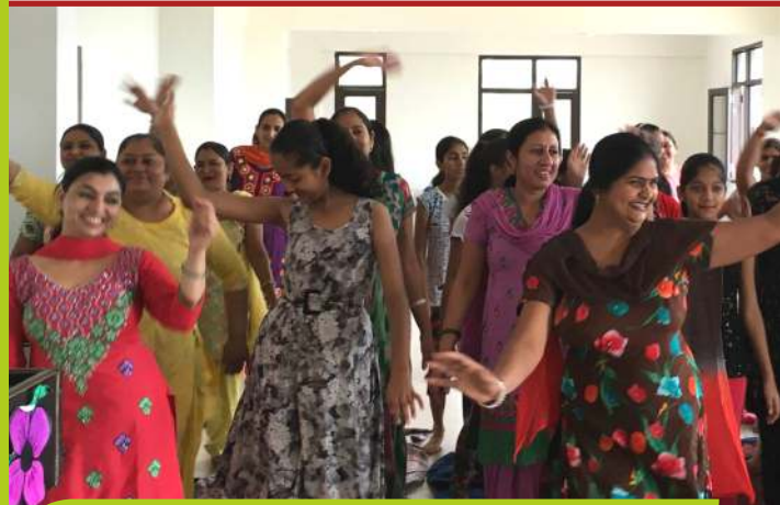
Happiness session for Mothers

Activities give the students an opportunity to develop various skills and exhibit their non-academic abilities. They actually complement the curricular and co-curricular activities and groom the students in the "Art of living and working together." They are the true and practical experiences gained by students by their own learning.