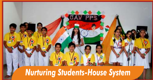
Nurturing Students-House System