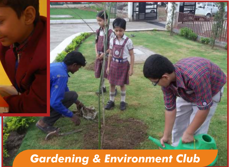
Gardening & Environment Club