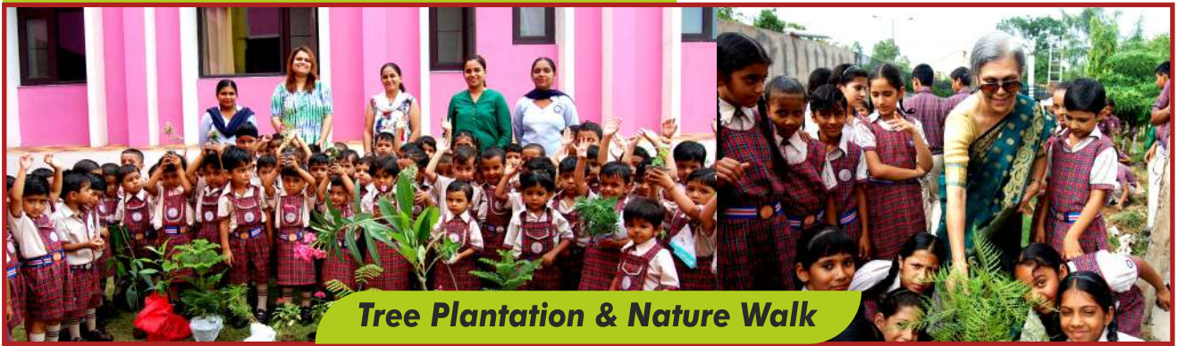
Tree Plantation & Nature Walk