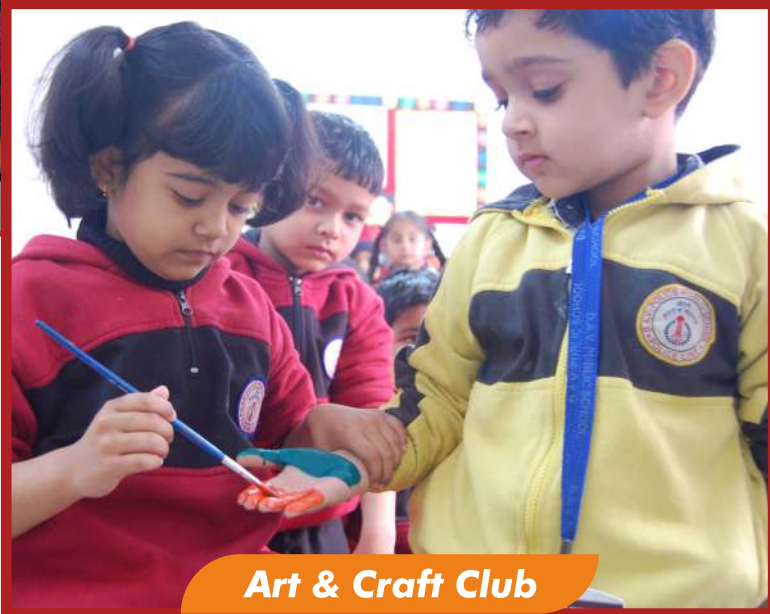
Art & Craft Club