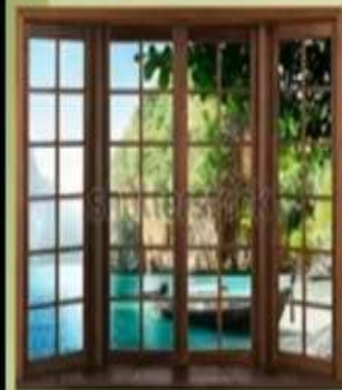
Doors and windows